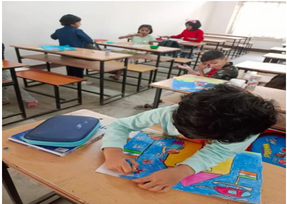
Art competition at Outline School of visual Art in occasion of Independence Day Celebration 15 th August,2022.