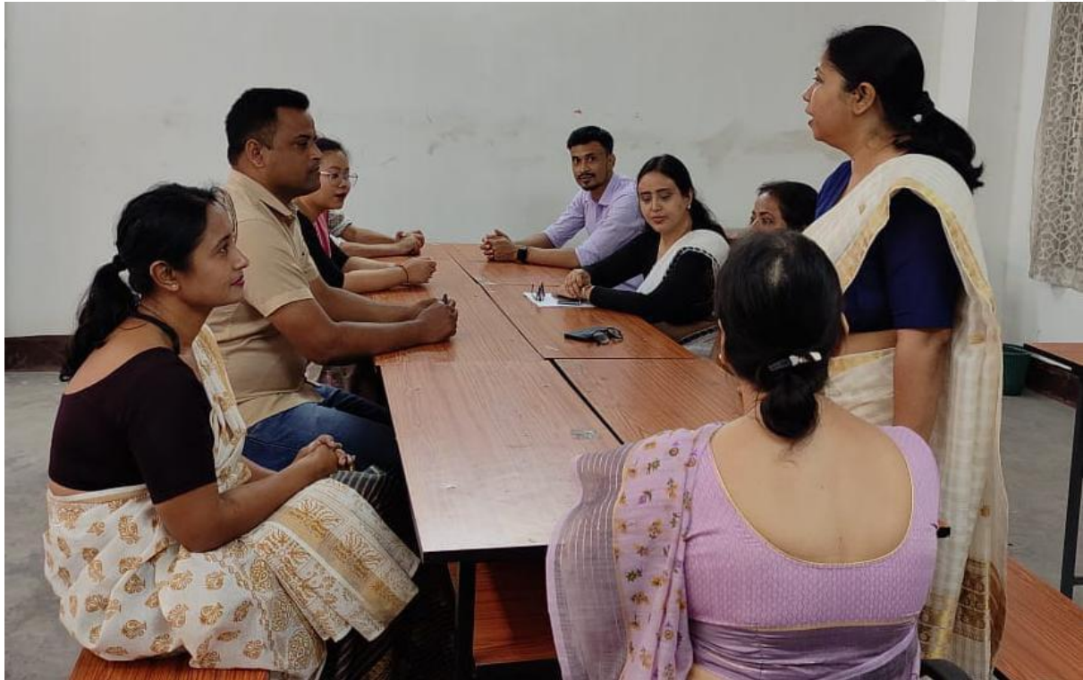
Meeting of Governance, Leadership and Management 2022-23

COLLEGE OF EDUCATION, NAGAON AFFILIATED TO GAUHATI UNIVERSITY, RECOGNIZED BY NCTE ACCREDITED BY NAAC (2014) ESTD:1992