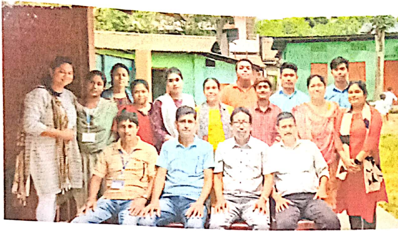
In Pic: A group photo of the Model English School's Staff