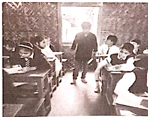
Photo: Examination Duty