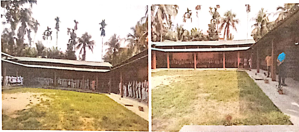
Photo: Students claded in White uniform on Wednesdays & Saturdays and regular dress on normal days lined up for assembly.