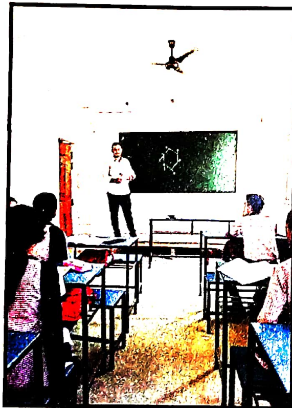
Picture showing Classrooms of the School

The overall condition of the classes are very good.