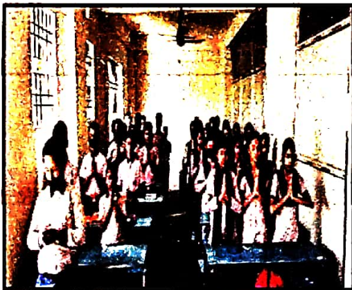
Picture of Morning Prayer

The morning prayer starts at 8:50am at Concept Senior Secondary School, Nagaon. The students gathers in their respective classes when the bell rings at 8:50am. They sing their daily prayers and sing the State Anthem "O Mur Apunar Dekh". It is followed by some light meditation which they can do while sitting in the classroom for about 5minutes to improve their concentration. They close their eyes and recites "Om" for a long interval. It helps them to start the day with a fresh mindset. After that the morning prayer session ends