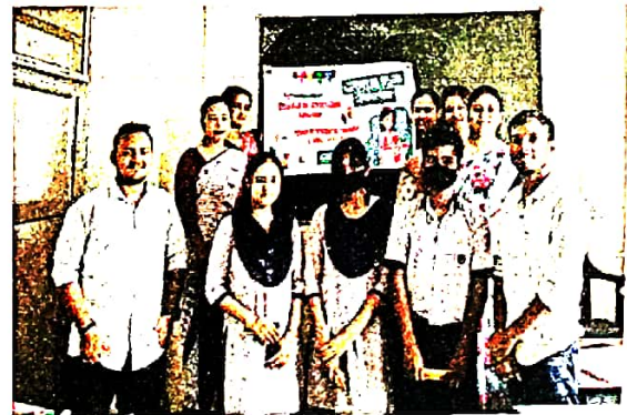
Picture taken with the position holders of the competition