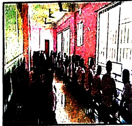
Picture showing Computer Lab in the School