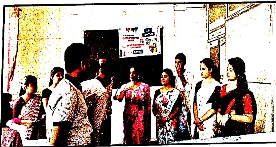
Picture showing prize distribution of the Quiz Competition