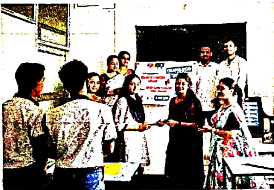
Picture taken during prize distribution

On 06/05/2023, we, the teacher trainees, organized an Extempore Speech Competition in the school premises for class VIII(8 th ) students. Various topics were provided to the students based on their moral and intellectual level of understanding such as Global Warming, Ozone Layer depletion, Water Pollution, My School ect. The students beautifully participated in the competition. They performed the task provided to them properly and secured best of their position. And prize distribution was done thereafter.