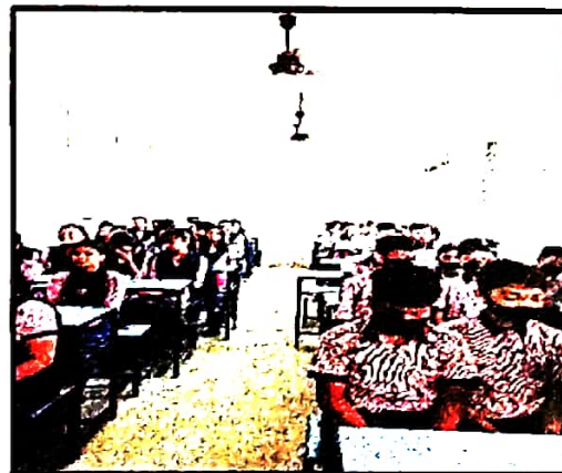
Picture of students during meditation