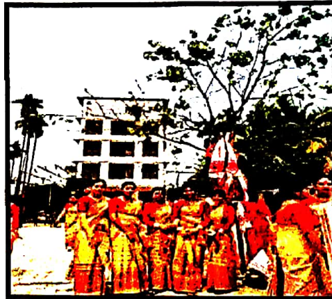
Picture showing some moments of Bihu Celebration in Concept Senior Secondary School