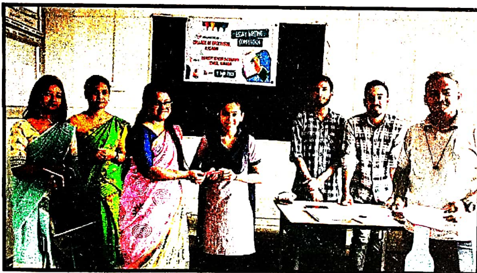
Picture showing Prize Distribution of the Essay Writing Competition