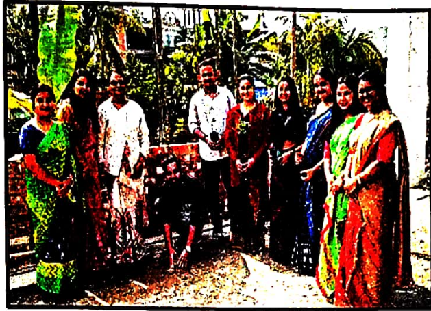
Pictures showing planting of the plant saplings in the school premises