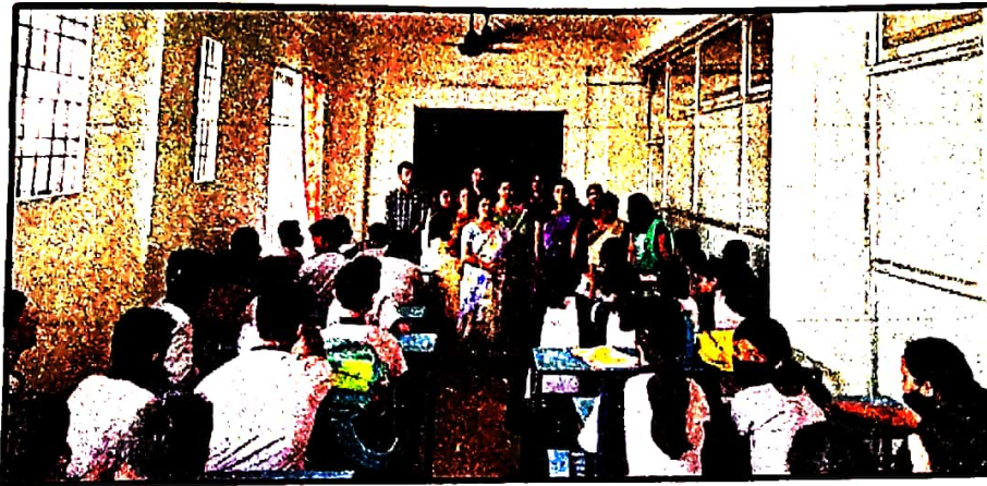
Picture showing teacher trainees and students during the Quiz Competition

A quiz competition was organized for the students of the class VIII (8 th ) based on general knowledge and general science on 10 th May, 2023. The students were observed to be very excited about the competition and all the students had active participation during the session. The winners were announced and prizes were distributed thereafter.