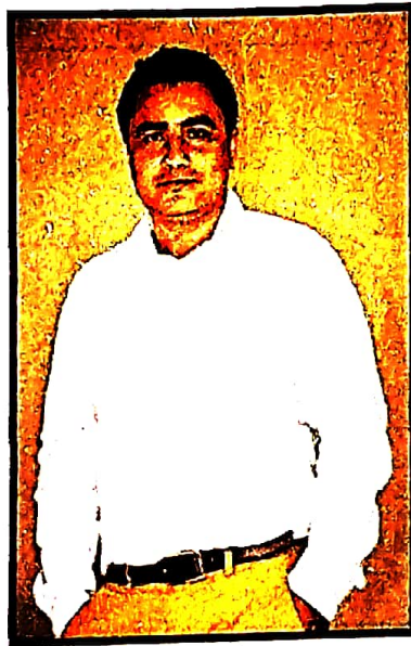
Principal of Concept Senior Secondary School, Nagaon

To conclude I can say that the Principal performed his role in school very well so that the smooth functioning of the school is very well maintained.