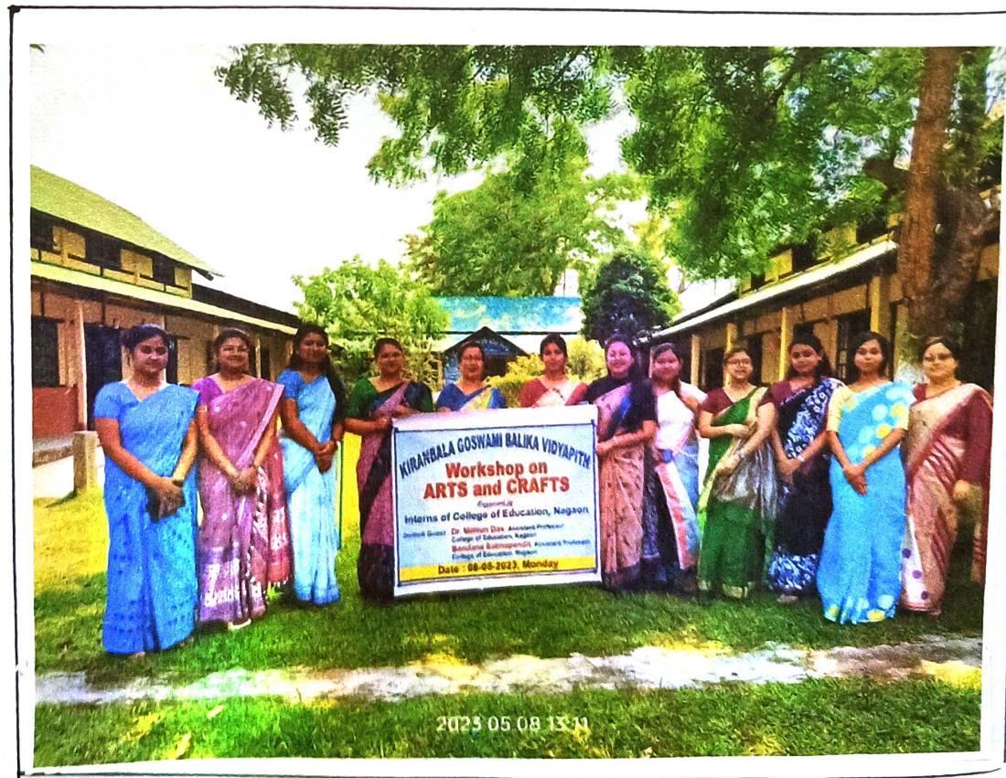
Workshop on art and craft