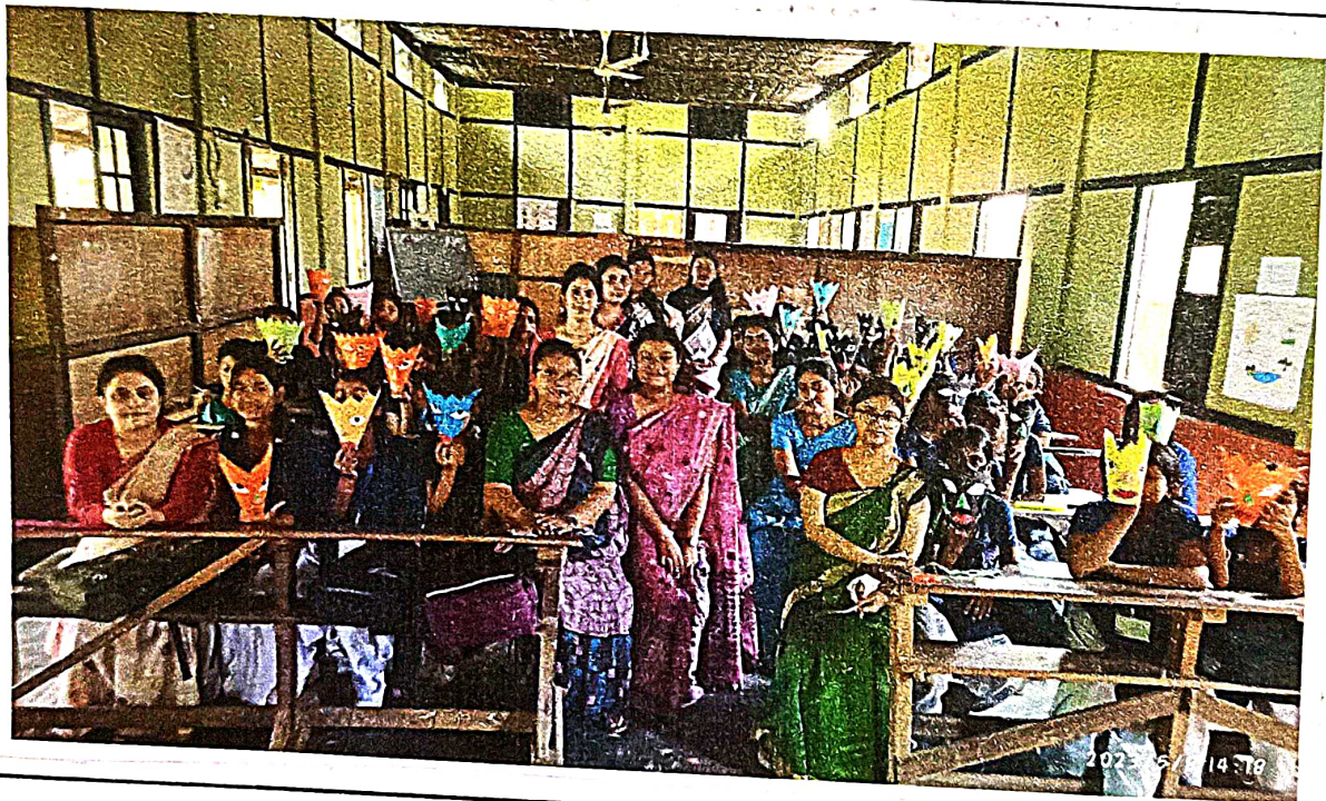
Workshop on art and craft